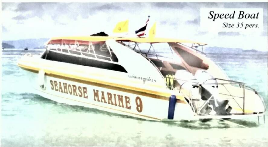
Speed Boat Size 35 pers.