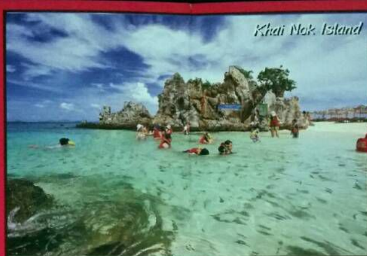
Khai Nok Island